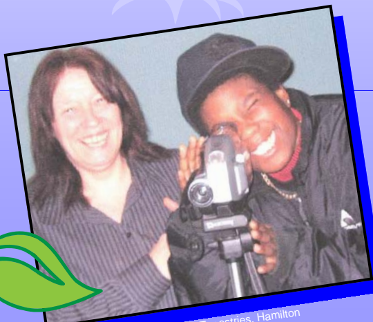
Weaving Tapestries, Hamilton

CAO: ...strives to facilitate broader and more inclusive definitions of community and community arts; provide network exchange and professional development opportunities for community art practitioners; provide support for marginalized communities.